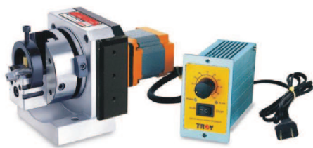
without dust cover